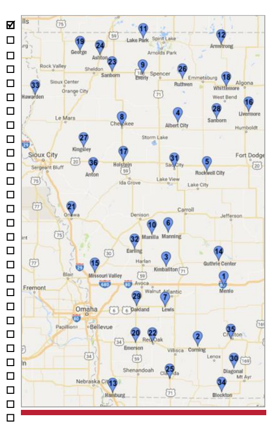
*Counties with Freedom Rocks® yet to be painted include: Buena Vista, Harrison, Montgomery, and Palo Alto. The map reflects the sites where they will be located.