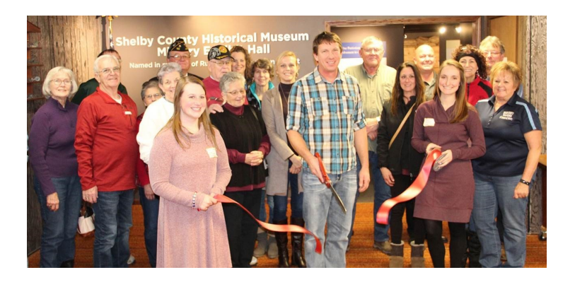
Ribbon Cutting Ceremony Shelby County Historical Museum, Harlan Monday, November 11